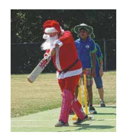
BlowFly Cricket is all about . . .