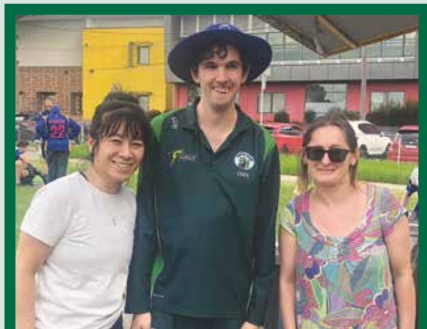
BlowFly Cricket working in partnership with NDCC deliver an inclusive all-ability Centre on Tuesday afternoons at James Park, Hornsby.