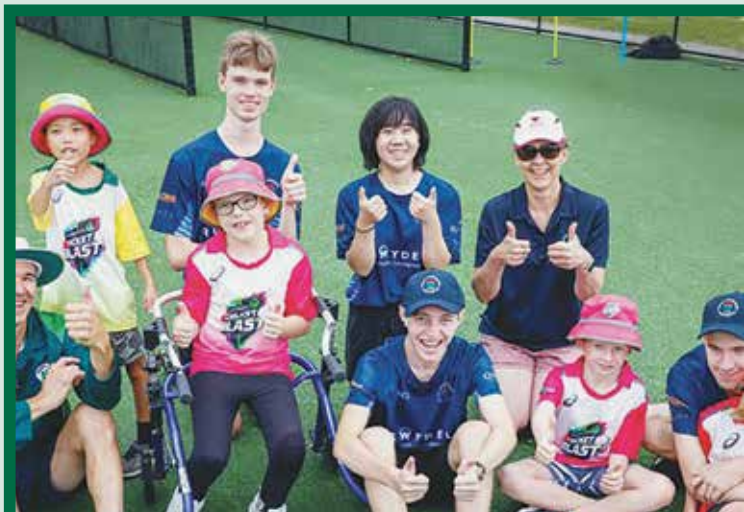
The BlowFly Cricket "Uncoachables Coaching The Uncoachables" program teamed with Manly-Warringah CC and Cricket NSW to provide coaches at the inaugural Northern Beaches All Abilities Cricket Program held on Saturday mornings at Cromer, Sydney.