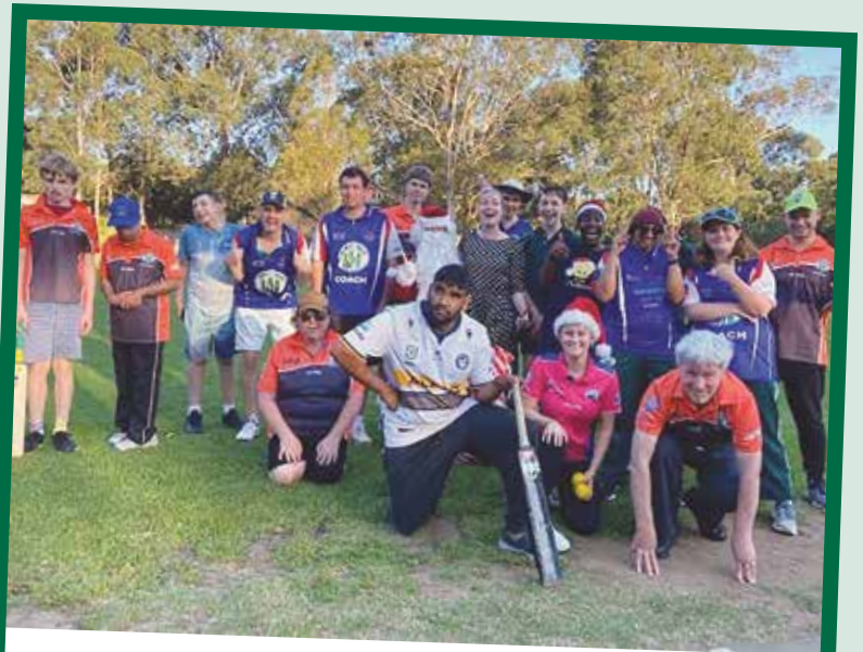
BlowFly Cricket working in partnership with WPHCCC deliver a popular inclusive all-ability Centre on Friday evenings at James Henty Reserve, Dural.