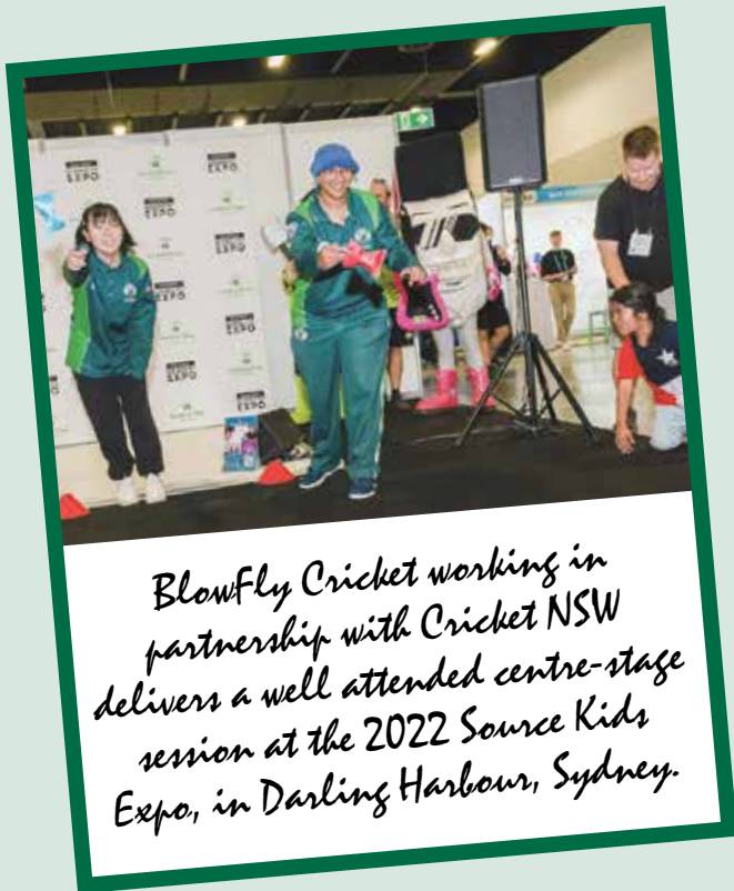
BlowFly Cricket working in partnership with Cricket NSW delivers a well attended centre-stage session at the 2022 Source Kids Expo, in Darling Harbour, Sydney.