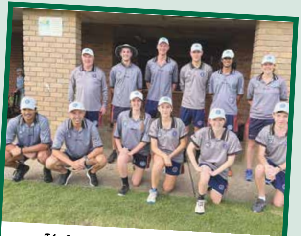
The Coaches' Association (HKHDCCA) supported the unique BlowFly Cricket "Uncoachables Coaching The Uncoachables" program by employing a number of our coaches as Assistant Coaches at several school holiday coaching clinics for children.