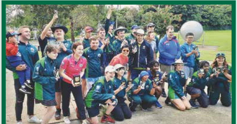
BlowFly Cricket delivers our most popular inclusive all-ability Centre on Saturday afternoons at James Park, Hornsby.