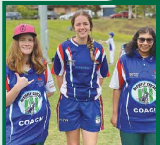
The BlowFly Cricket "Uncoachables Coaching The Uncoachables" program teamed with WPHCCC to provide coaches at the Junior Blasters & Master Blasters programs held on Saturday mornings at Cherrybrook, Sydney.