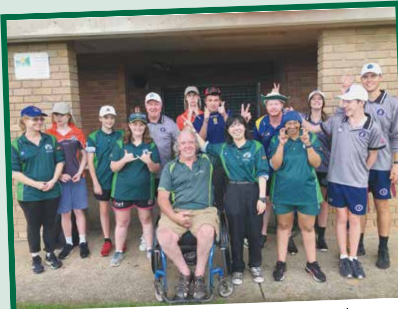
The Coaches' Association (HKHDCCA) hosted a free Coaching Clinic for BlowFly Cricket members at Montview Oval, Hornsby Heights.